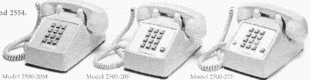
Model 2500-20M Basic Model 2500-20F Flash Model 2500-27E Flash/Message Waiting