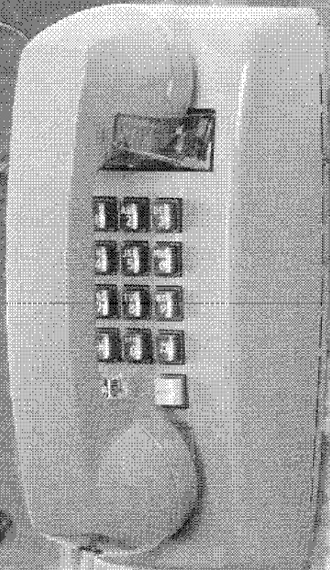
Model No. 2554-27F